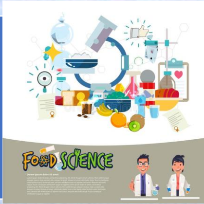
Food Science & Technology