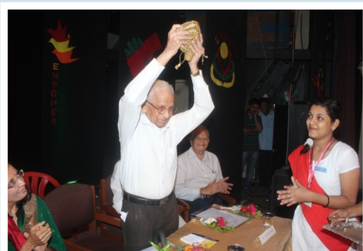
Funds Collected by students handed over to the Trust