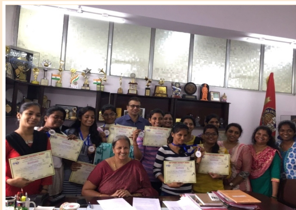
Prize winners - Yuva Mahotsav