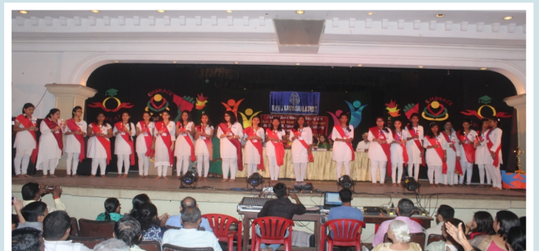
Oath Ceremony of the General Secretaries