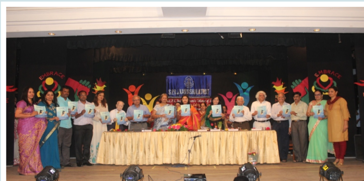
Release of College Magazine - "Aalekh"