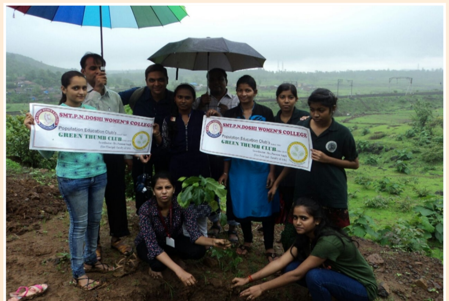
Vanmahotsav at Kasara

Participated in Vanmahotsav (Tree Plantation) at Kasara organized by Kasara Area Forest Department and Kasara Gram Panchayat on July 01, 2016. 31 Under Graduate students planted 250 saplings. The Forest Dept. Officials and Kasara Gramsevak oriented the students about the importance and conservation of the trees.